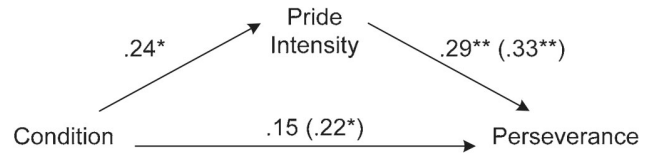
Figure 3. Path model specifying pride as the mediator of perseverance. Parameters in parentheses represent zero-order correlations. Condition is coded as follows: nonpride conditions = 0, pride = 1. * p < .05 . ** p \leq .01 .

ened pride led to greater perseverance on a difficult and tedious task when compared with control conditions. In addition, these studies ruled out two alternative explanations for this increased perseverance. Study 1 demonstrated that simple expectancies of efficacy or success were not sufficient to engender increased effort. Similarly, Study 2 revealed that positive mood was not a viable mechanism for producing increased perseverance in this paradigm. Of import, Study 2 also provided clear evidence that the intensity of pride directly mediated perseverance. Taken together, these studies are unique, as they constitute some of the first empirical evidence documenting the functional role of pride in shaping goal-directed behavior, and, thereby, identify a new emotional mediator of perseverance.